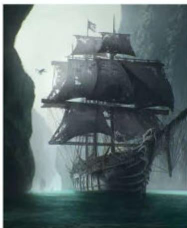
PIRATES OF THE CARIBBEAN